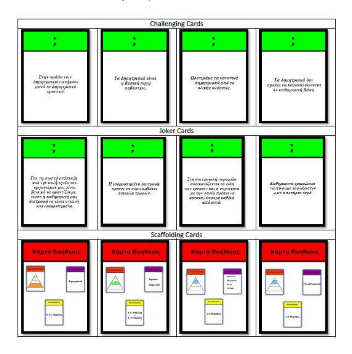
Figure 2. An example of Challenging/motivation/scaffolding cards designed for an ECCG for the learning of the Food Pyramid

Step 6: Definition of the kind of scaffolding used during CG-play. A number of "Scaffolding Cards" have been designed (6 cards). These cards have textual and figurative parts and refer to foundational points of the concepts included in the subject matter model. Actually, those cards contain the combination of three basic cards fall in each Food Group. "Scaffolding cards" appear on player's demand when he/she is unable to do the right matching. An example of this kind of card is illustrated in the 3<sup>rd</sup> row of Figure 2.