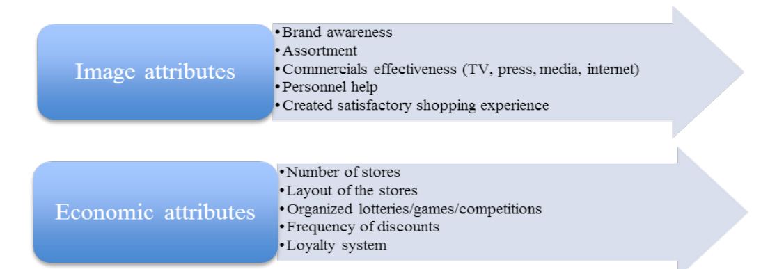
Fig. 1. Categorization of store attributes: 0image and economic attributes.

To observe what impacts consumer behavior, the authors grouped the store attributes used for the analysis in two main categories: economic attributes and image attributes. The categories are represented in Figure 1: